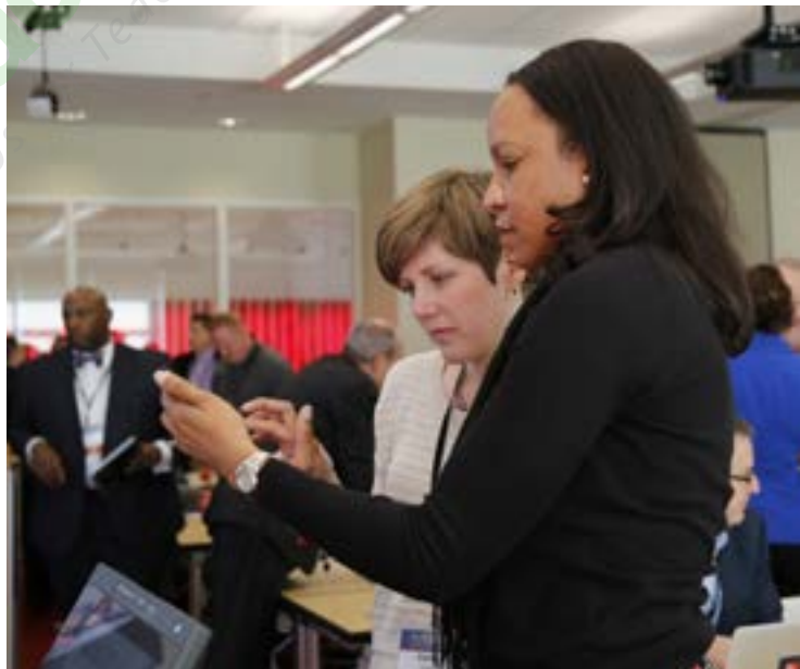
District leaders learn from each other at the Future Ready Summit in Raleigh, NC

Not every teacher will be an early adopter, and not every teacher will pick up your product with a curious willingness to play and see what it can do. No matter what you build, plan an accompanying professional learning component that outlines the basic structures, functions, and abilities of your tool. An online training module, space for a community of users to collaborate, or co-created collection of suggestions will help more reticent users start to feel at home with