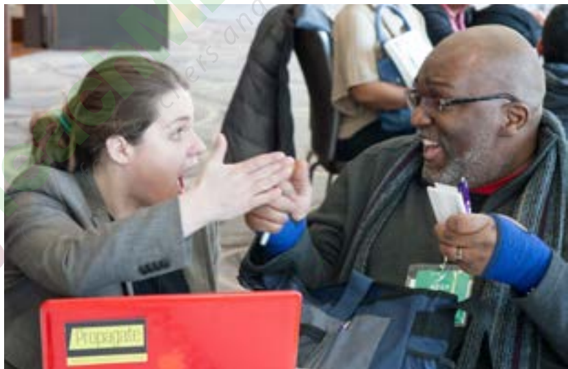
Teacher provides feedback to an entrepreneur at an ed tech summit in Baltimore

Random assignment to create the comparison groups is the preferred approach but is not always feasible, so other matching techniques are often used. It is important to understand and acknowledge their limitations when making claims about the impact or effectiveness of your app or tool.