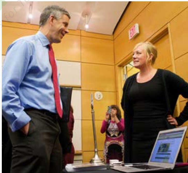
Education Secretary Arne Duncan visits with app developers at an Education Datapalooza