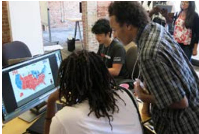
Students test games at White House Education Game Jam

Depending on what your app or tool does, you will need to determine the best way to measure effectiveness. If you are trying to improve learning in academic subjects, in addition to demonstrating that you are aligned with relevant college and career ready standards, the tests, quizzes, and checks for understanding you provide must be validated against the measures educators care about: their own classroom assessments as well as standardized tests. If you are looking to support non-cognitive factors such as grit, persistence, and