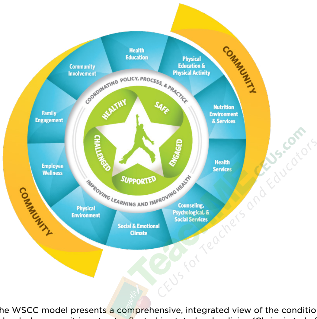
Figure 1. The Whole School, Whole Community, Whole Child (WSCC) Model

The WSCC model presents a comprehensive, integrated view of the conditions for learning in schools; however, it is not yet reflected in state-level policies (Chriqui et al., forthcoming ). Although state laws and regulations address many elements of the model, these policies are fragmented and are not yet integrated to best support the whole child.