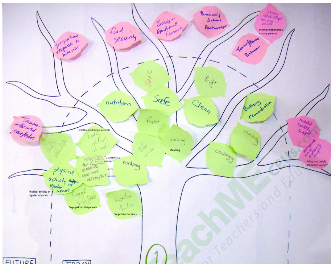
Figure 3. Policymakers' Visual Representation of What a Healthy School Looks Like Today (green) and What It Could Look Like in the Future (pink)

The research team conducted phone interviews to expand upon initial findings from the focus groups. The research team also conducted phone interviews with educators. Student interviews tended to be shorter, lasting 15 to 30 minutes, whereas policymaker and educator interviews were longer, lasting 30 to 60 minutes. Participants (and their parents, if applicable) provided written consent/assent prior to the focus group discussions and verbal consent/assent prior to the telephone interviews. All interviews, except those conducted with state legislators and legislative staff, were audio-recorded with participant consent/assent and transcribed from the recordings shortly after they took place.